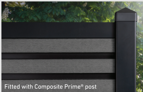
Fitted with Composite Prime® post